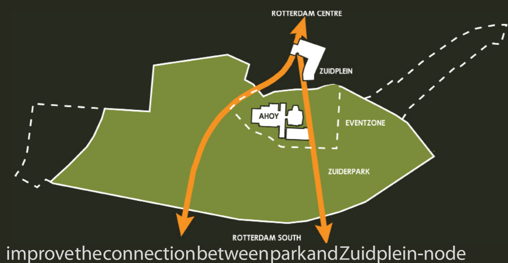
improve the connection between park and Zuidplein-node