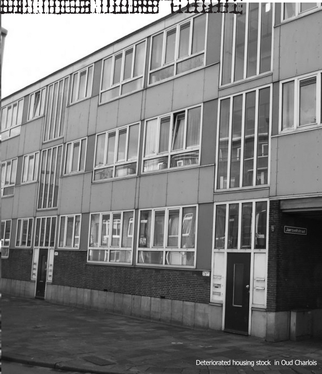
Deteriorated housing stock in Oud Charlois

main conditions formed were easy access for the neighbourhood, visibility and placement in the heart of the district. Finally a former and long time abandoned shop in Oud Charlois has been renovated with the help of some local artists. The renovation directly addressed the potential of decayed space in the base of housing blocks. By low-tech renovation solutions and with little money a distinguishable center has been constructed, while the quality of public space has simultaneously been altered. The renovation project was supported by students of our faculty.