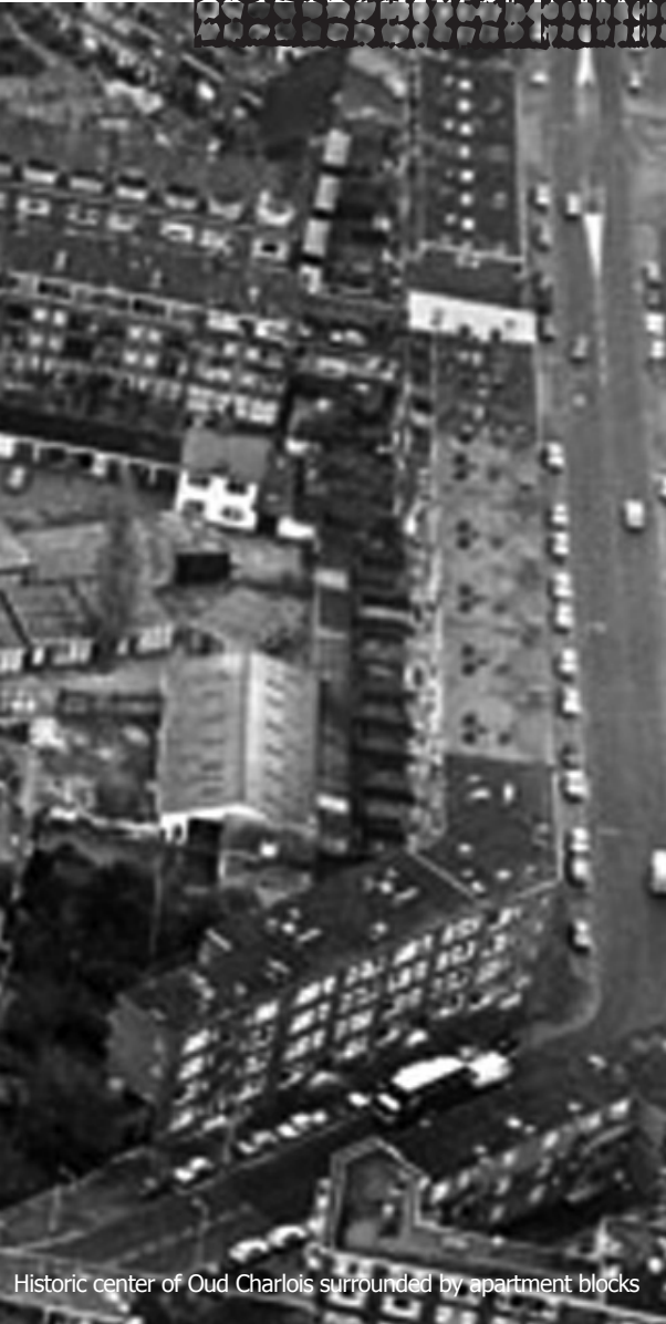
Historic center of Oud Charlois surrounded by apartment blocks